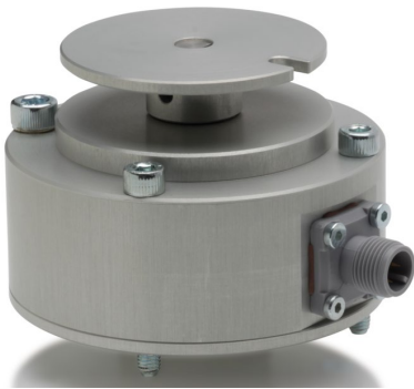
Metallux precision potentiometer POL 790