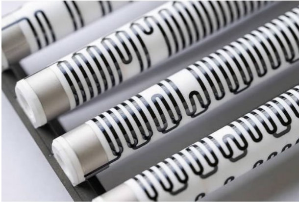
Tubular high-voltage resistor