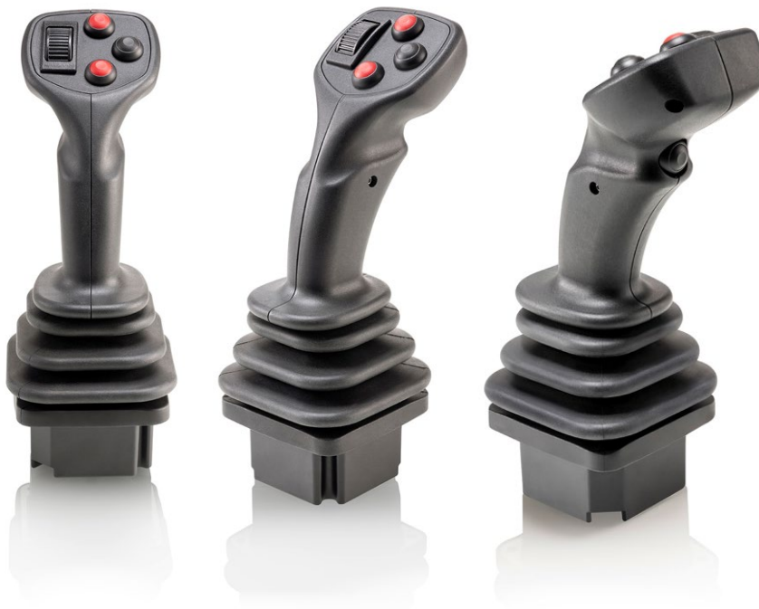
Metallux Hand-Joystick MJ-30K