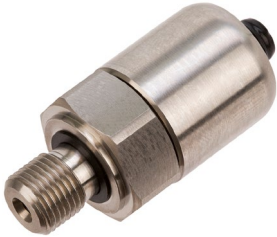
Metallux pressure transmitter MTX-F