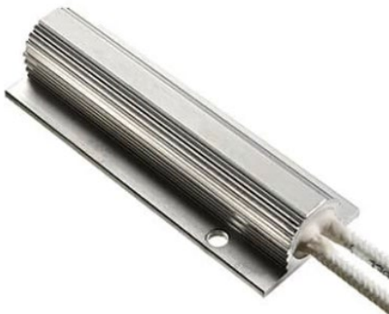
Power wire resistor PWR-S