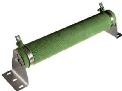
Power wire resistor PWR-TR 3XX